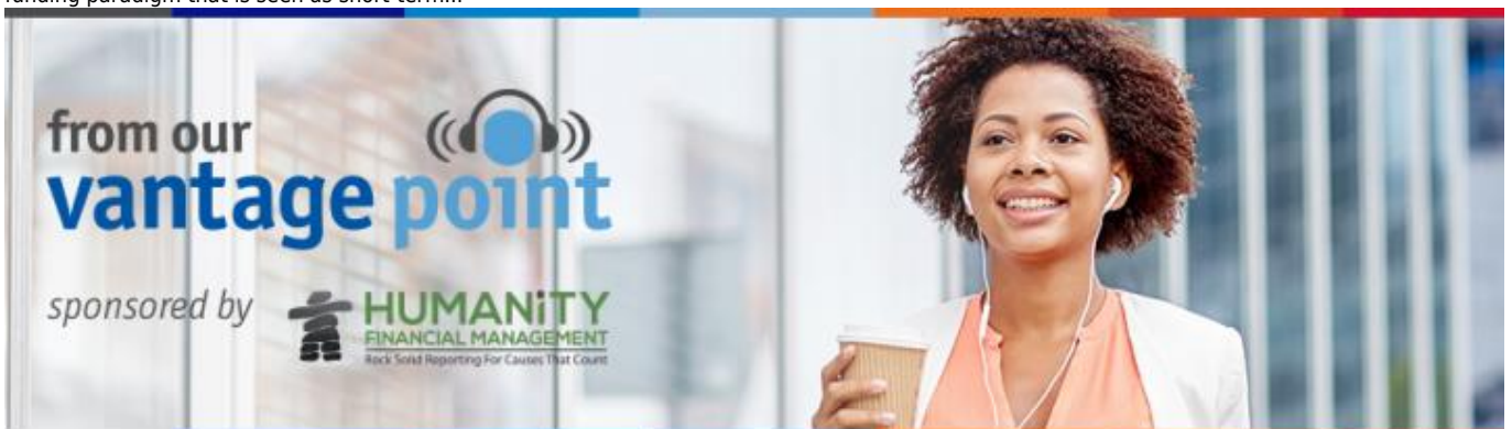
From Our Vantage Point Episode 50 - Celebration Episode: Not-for-profit podcasting